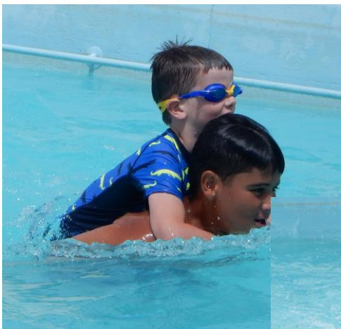
Rooms 2 and 6 enjoying Buddy Class swimming