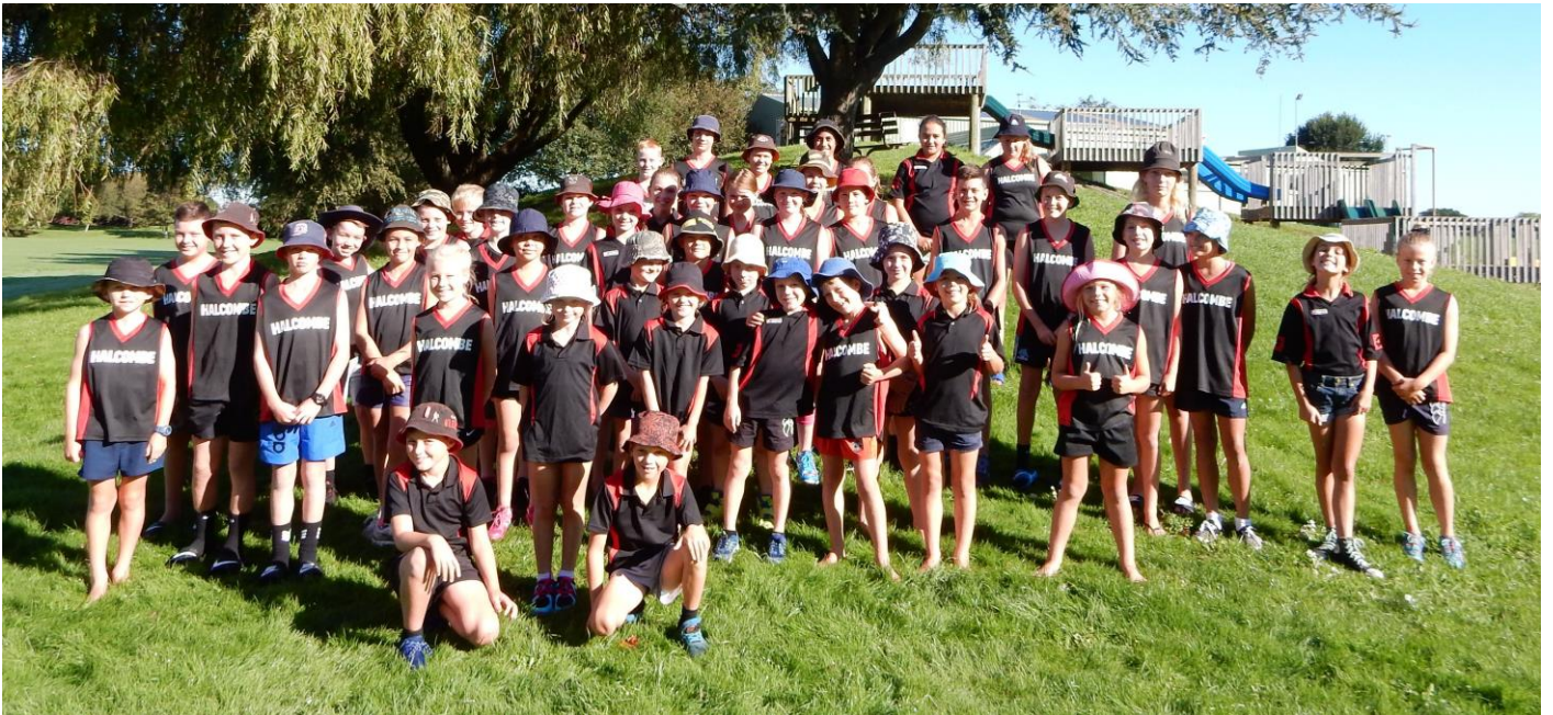
Our Interschool Athletics Team which completed yesterday