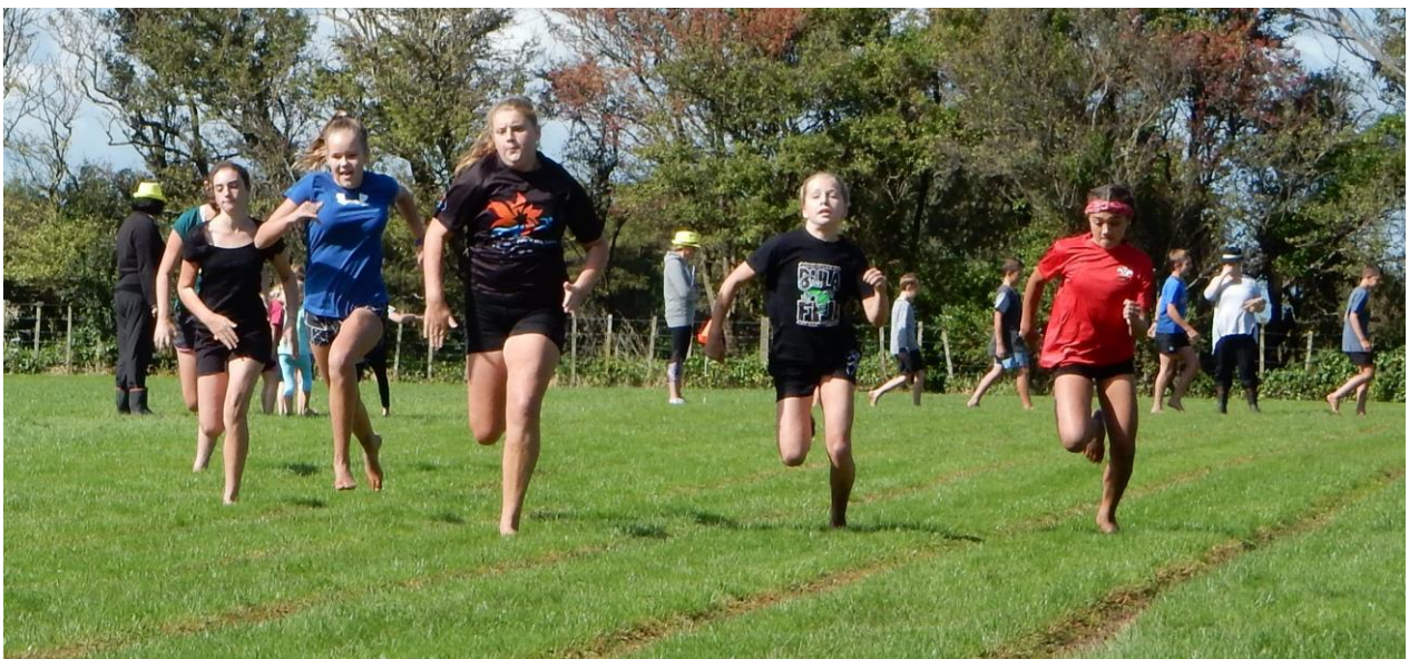
Some of our senior girls in the 100m sprint at school last Friday