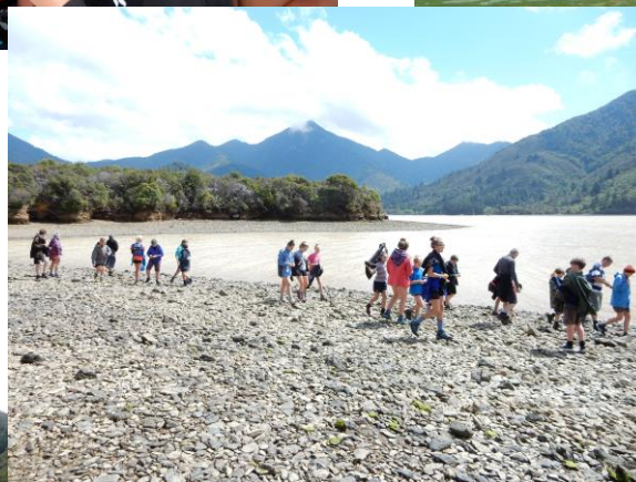
Nydia Bay 2016