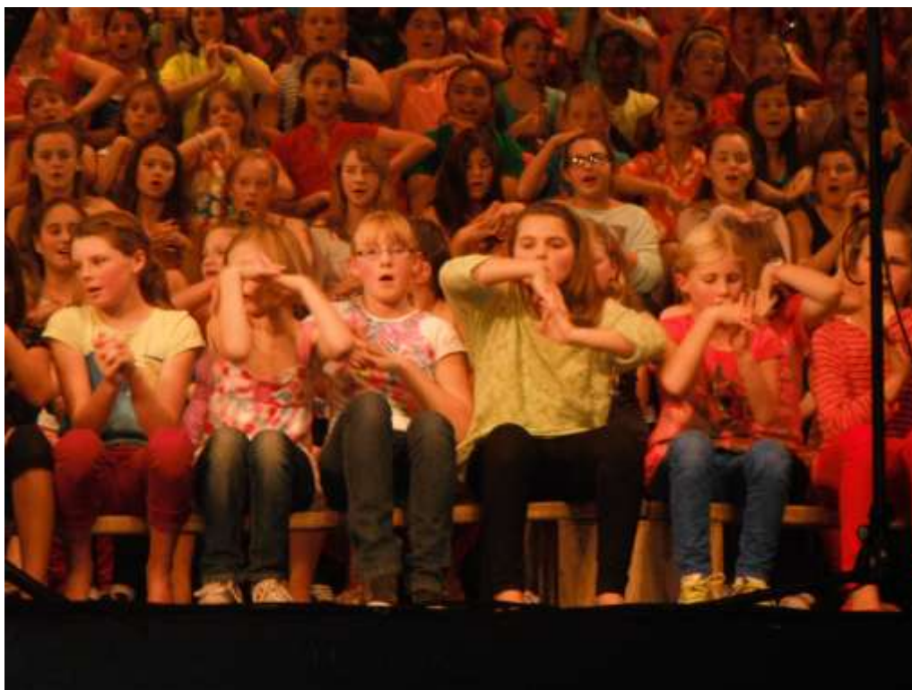
Front row seats at the Kids for Kids Concert!